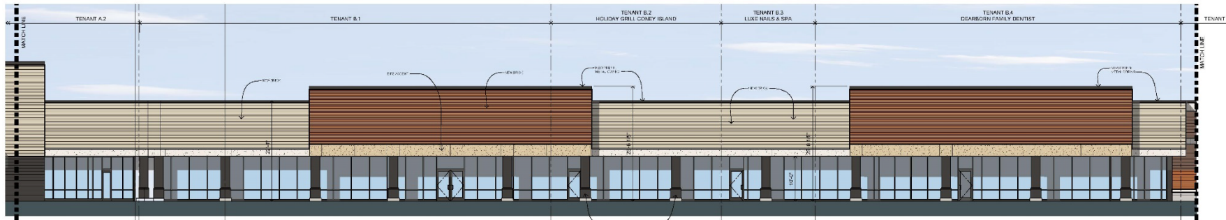
Proposed South (Front) Elevation 3/32" = 1'-0"