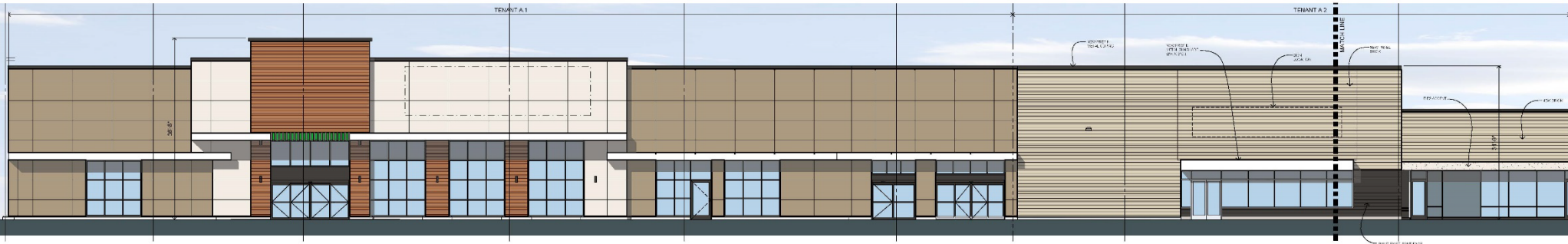
Proposed South (Front) Elevation 3/32" = 1'-0"