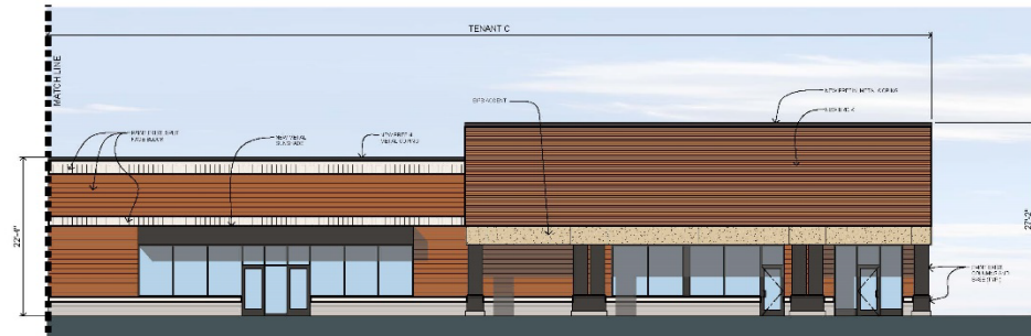
Proposed South (Front) Elevation 3/32" = 1'-0"